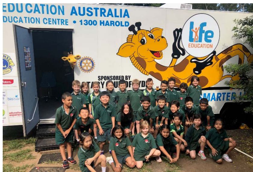
We love learning about water safety