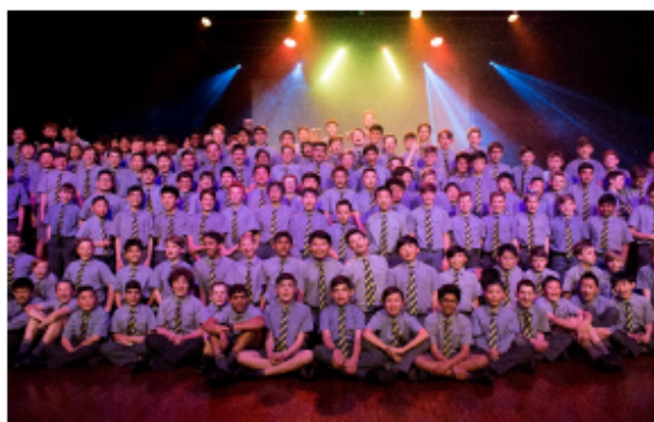
Year 7, Massed Choir

Information Afternoon Thursday 21 February 2019 4 – 6 pm