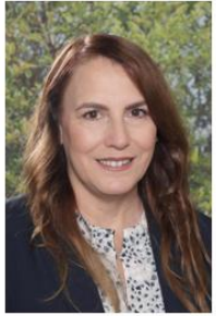
Miss Parada Principal