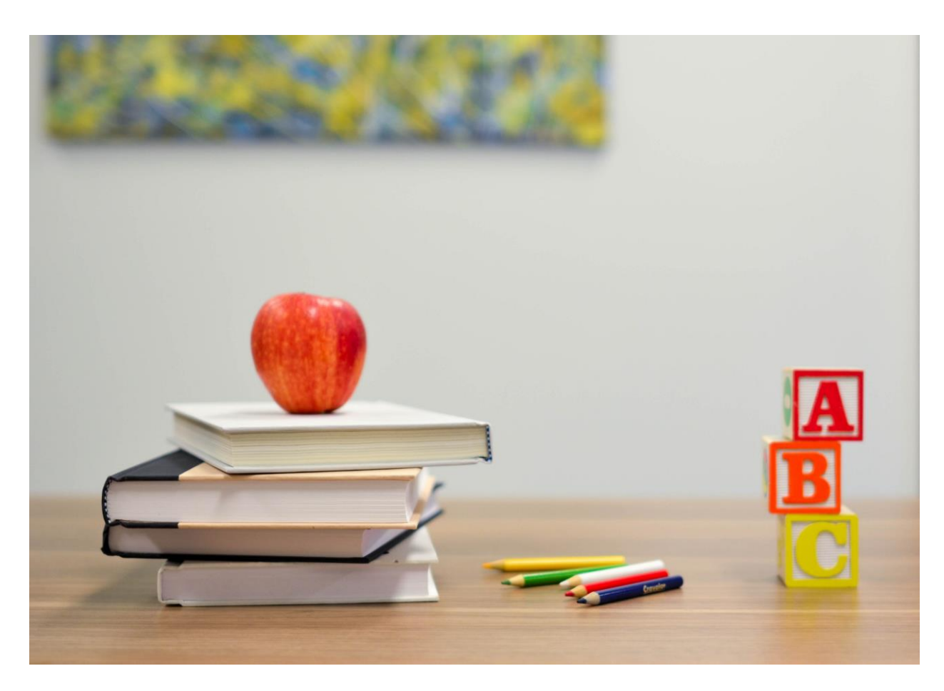
Year 1 Term 1 Overview 2024